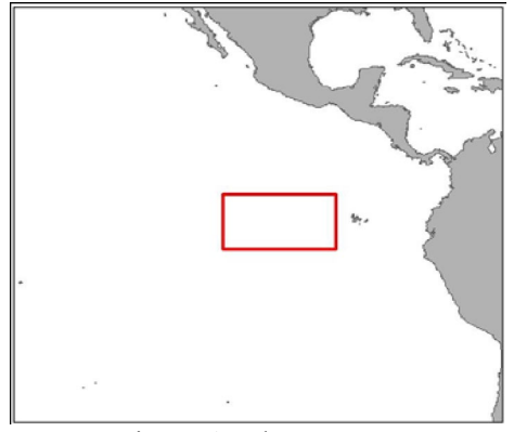
Figure 1. Closure area

13. a. For each one of the closure periods stipulated in paragraph 3 of this Resolution, each CPC shall notify the Director, by 1 June of each year, the names of all the purse-seine vessels that will observe that closure period, also identifying those that must observe additional closure days pursuant to paragraphs 4 and 5 of this resolution.