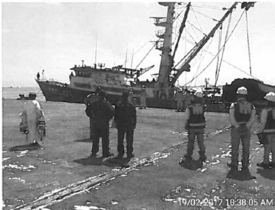
Foto 2. E/P ROSSANA L acoderada en el muelle terminal portuario de paracas S.A.