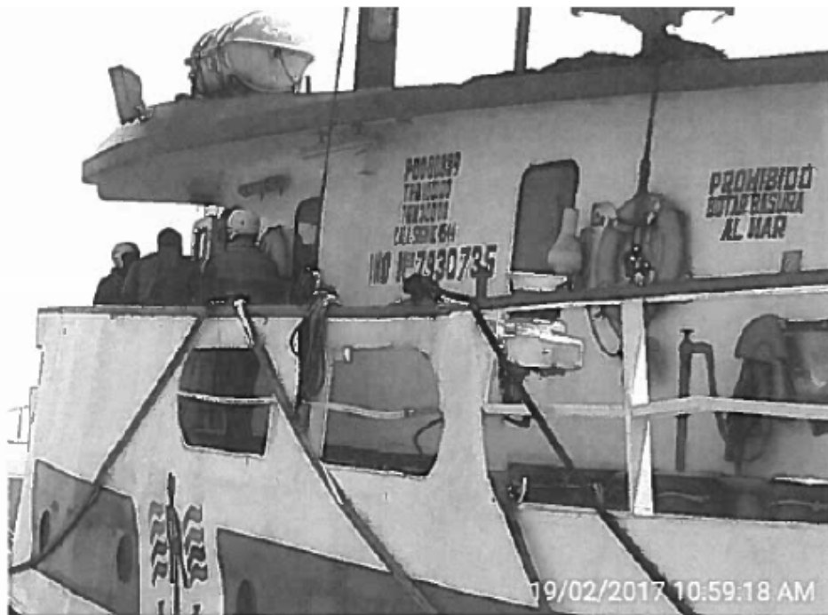
Foto 3. E/P ROSSANA L, con IMO n° 7930735 y matrícula Ecuatoriana P-00-00839