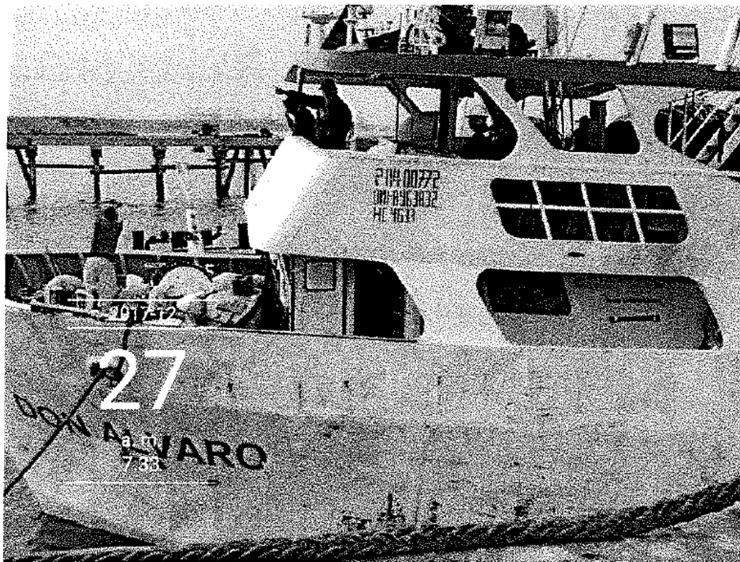
FOTOGRAFIA N° 01: Embarcación Pesquera de bandera ecuatoriana DON ALVARO (P-04-00772), acoderada en el muelle Centenario de Pesquera Diamante S.A. – Callao, la cual fue intervenida por los fiscalizadores de la DGSFS-PA, en incumplimiento de la normativa pesquera vigente.