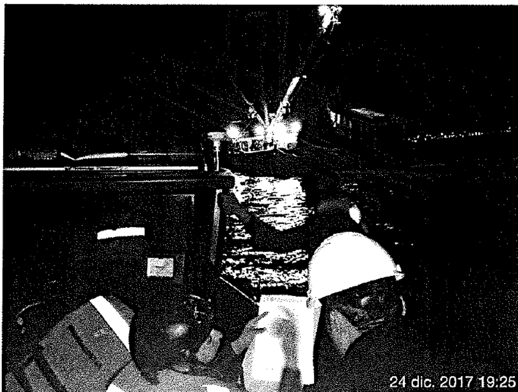
FOTOGRAFIA N° 01. Traslado de los inspectores de la Dirección General de Supervisión, Fiscalización y Sanción del Ministerio de la Producción (DGSEFPA), por parte de personal de la Dirección de Capitanías y Guardacostas de la Marina de Guerra del Perú (DICAPI) hacia la embarcación YELISAVA, fondeada en la bahía del Callao.