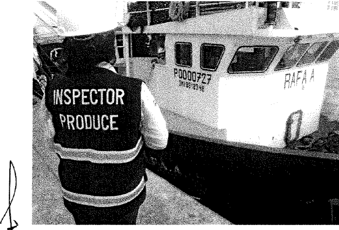
FOTOGRAFIA N° 01: Embarcación de cerco de bandera extranjera (Ecuatoriana) RAFA A (P-00-00727), acoderada en el muelle centenario de Pesquera Diamante S.A. – Callao, la cual fue intervenida por los fiscalizadores de la DGSFS-PA, por incumplimiento de la normativa pesquera vigente.