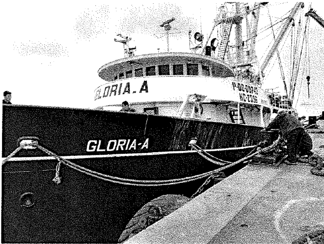
FOTOGRAFIA N° 01: Embarcación de cerco de bandera extranjera (Ecuatoriana) GLORIA A (P-00-00743), acoderada en el muelle centenario de Pesquera Diamante S.A. – Callao, la cual fue intervenida por los fiscalizadores de la DGSFS-PA, por incumplimiento de la normativa pesquera vigente.