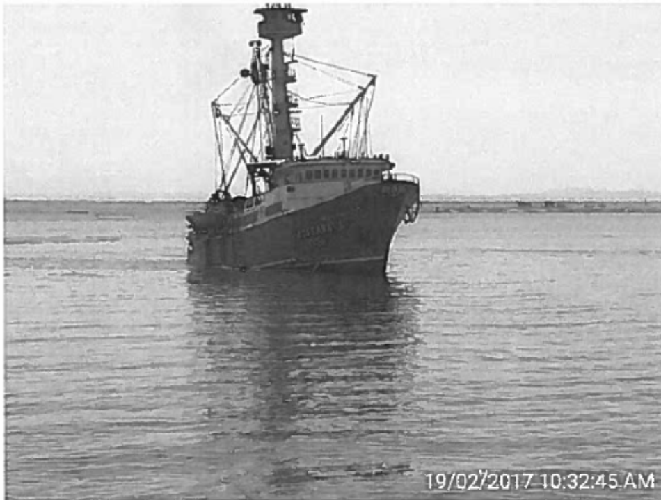
Foto 1. E/P ROSSANA L, intervenida por DICAPI arribando al muelle.