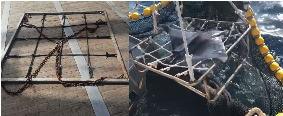
Figure 1. Sorting grid (left) and a mobulid released using the sorting grid (right).

To define and test safe-handling and release best practices for mobulid rays, including the development of BRDs and gear modification, 12 sorting grids designed by AZTI were constructed for each of the 12 participating purse seine vessels (Figure 1). For this activity, scientists from UCSC and AZTI monitored sorting grid use on board purse seine vessels, during three trips. During those trips, scientists (i) evaluated the efficacy and time of release of mobulids using sorting grids or another release method (i.e., stretchers, manual, etc.) and (ii) evaluated post-release mortality using survivorship tags (sPAT tags). Fishers also evaluated the efficacy of the sorting grid during the fishing operation by filling out a form specifically designed for the project.