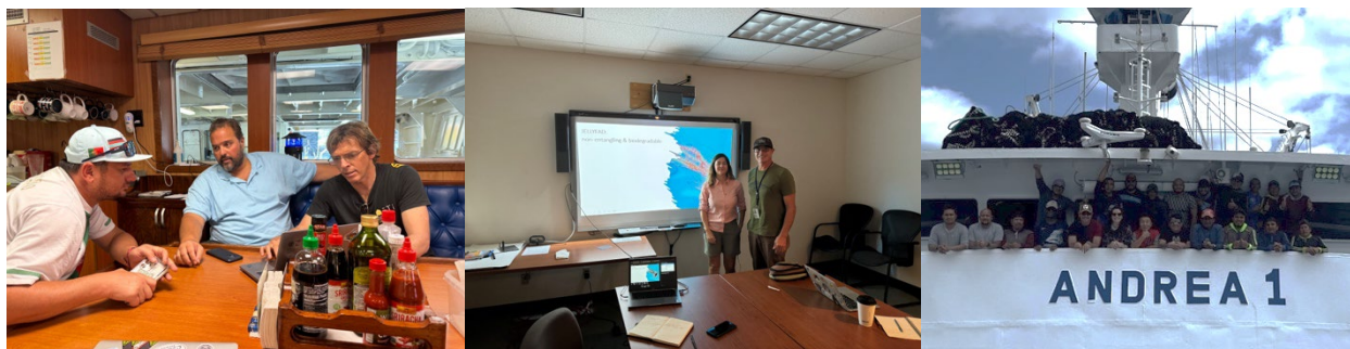
Figure 3. Project scientists training fishers on board purse seiners for mobulid tagging, sampling, and testing the sorting grid.

Finally, one of the key objectives of the project is to educate and raise fishers' awareness on mobulid conservation, train them on mobulid species identification, tissue collection and tagging (Figure 3). In person and online meetings were held with fishers as well as onboard purse seiners during port visits (e.g., Pago Pago, Manta). Generally, fishers demonstrated interest in improving handling practices and contributing to mobulid conservation, which will likely make it easier to implement better bycatch release practices in the long term.