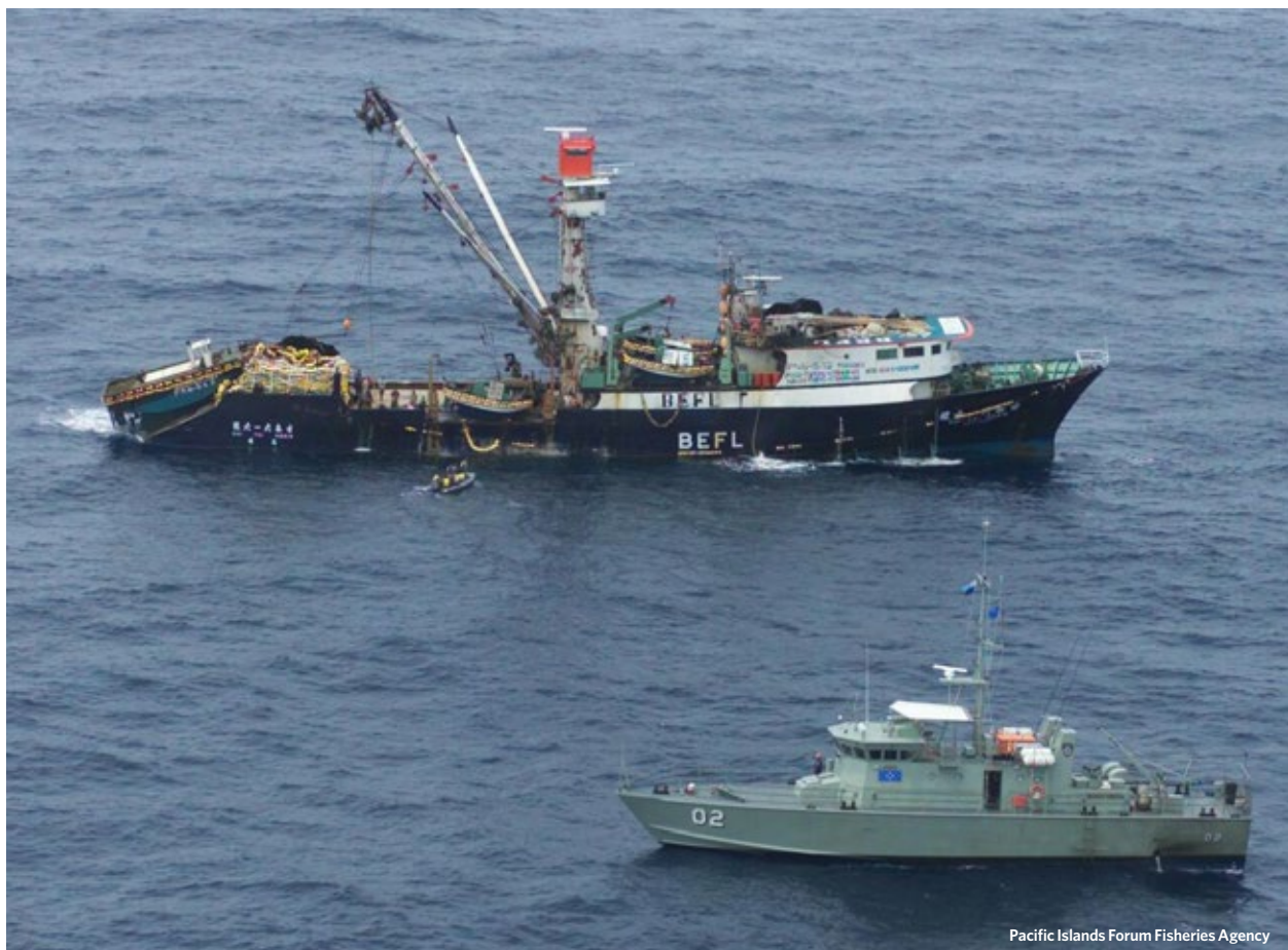
Officials on a Micronesian patrol boat prepare to board a purse seine fishing vessel in national waters.

Flag States, relevant coastal states, and RFMOs should have mechanisms in place to ensure effective implementation of VMS regulations and to apply appropriate penalties when those regulations are not followed—including possible revocation of the authorization to fish.