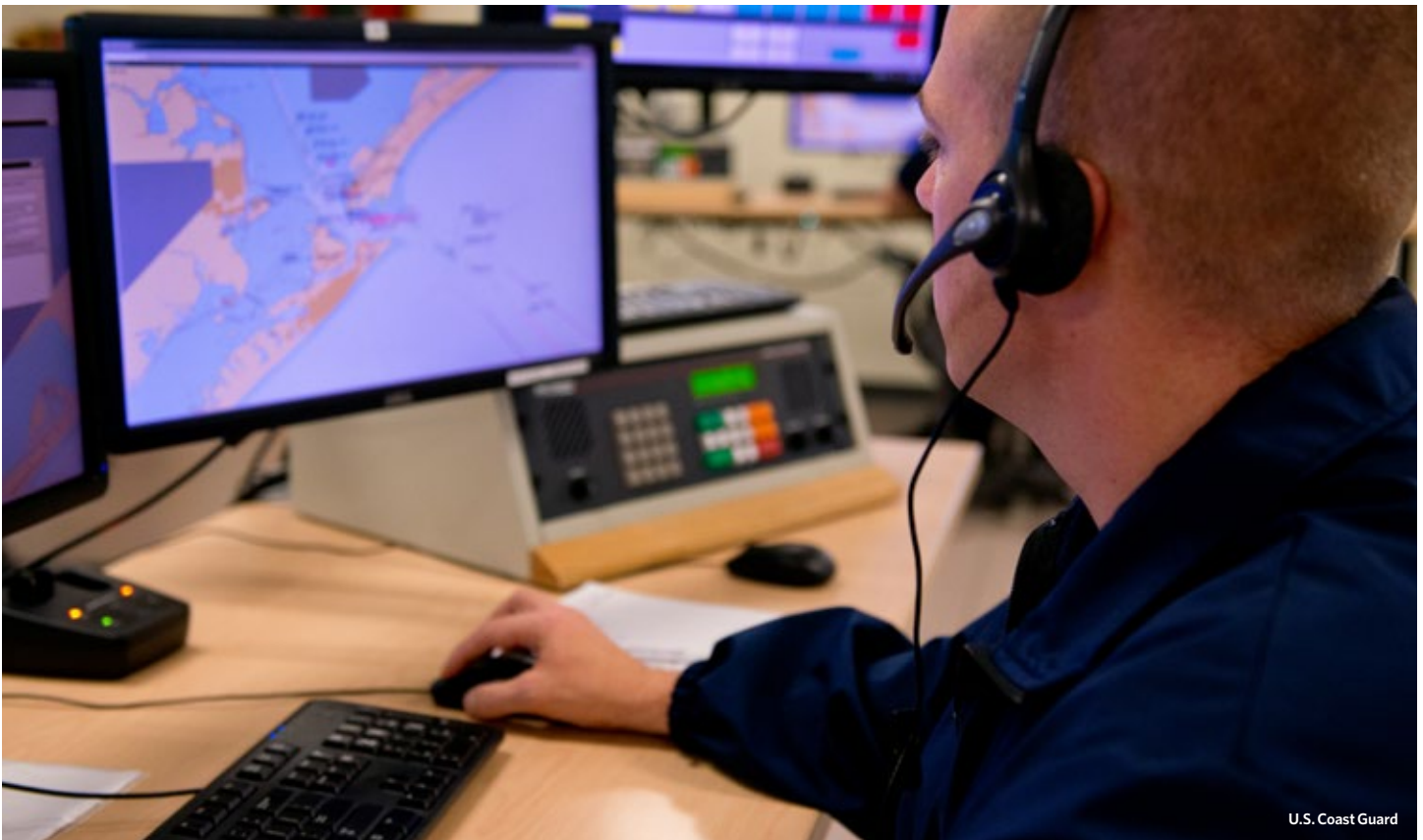
U.S. Coast Guard