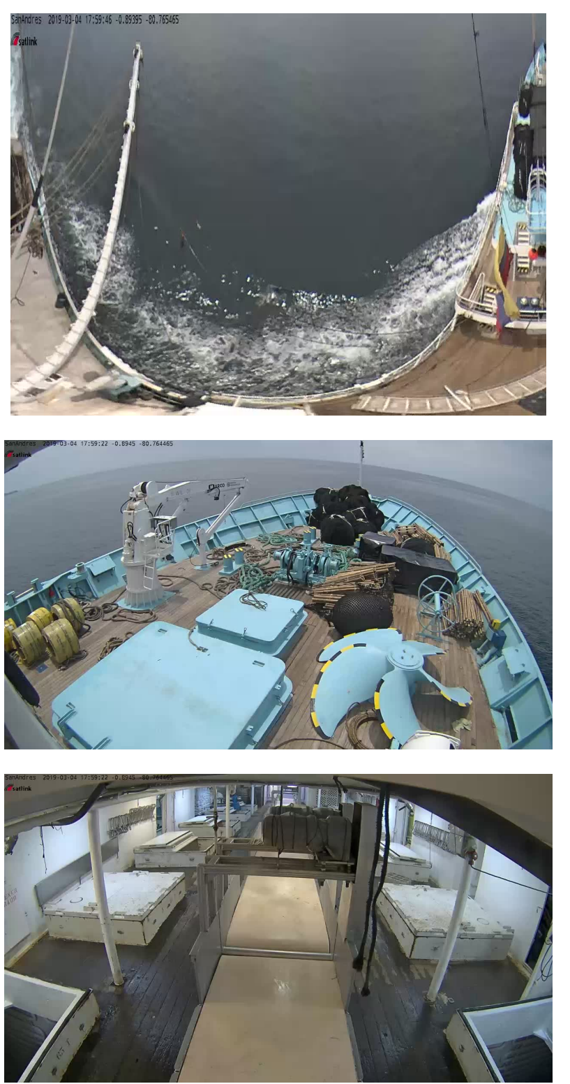
FIGURE 2 . Images from cameras on the San Andrés , aimed at the port side (a), bow (b), and well deck (c). FIGURA 2. Imágenes de las cámaras en el San Andrés , apuntando al lado de babor (a), a la proa (b) y a la cubierta de bodegas (c).