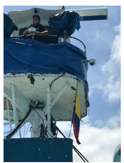
FIGURE 3 . Installation of cameras on the Romeo . Checking cameras (a) aimed at sacking area (b), work deck (c), bow and port side (d).

FIGURA 3. Instalación de cámaras en el Romeo . Revisión de cámaras (a) apuntando al área de embolse (b), a la cubierta de trabajo (c), a la proa y al lado de babor (d).